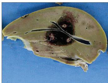
Figure 1: Following NanoKnife IRE treatment, blood vessels, ducts, and other collagenous structures in the treated area remain viable.

Irreversible electroporation, or IRE, is a generation apart from other ablation therapies that use extreme heat or cold, radiation or microwave energy. Unlike these ablative modalities, the NanoKnife IRE System is non-thermal, poses no heat sink issues and does not affect the blood vessels, ducts, and other critical structures. As a result, NanoKnife IRE System has the potential to expand the application for focal ablative therapy to include cells at or near vital structures—making NanoKnife a compelling treatment option in difficult-to-treat areas and for patients who are not candidates for surgery due to the location which requires treatment.